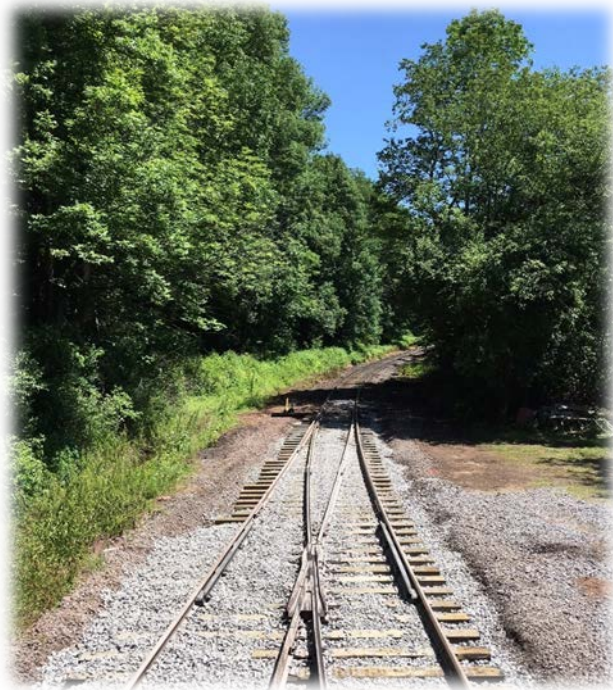
New re-constructed main-line switch at Halcottsville, our mid-point terminal between Arkville and Roxbury