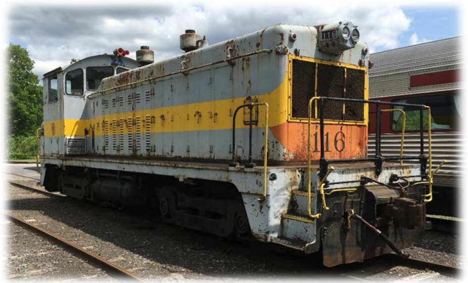
The #116 a 1948 switch engine that once was operated by the legendary New York, Ontario & Western Railroad along their rails in the Catskills will be restored and repainted as a tribute to this classic railroad.

Continuing its commitment to attract more visitors to Delaware County and the Western Catskills, the Catskill Revitalization Corporation's – Delaware & Ulster Railroad announces a major investment in the railroad's infrastructure and equipment of over $100,000. We are calling the project the "Spark Initiative". The project is focused on preparing the